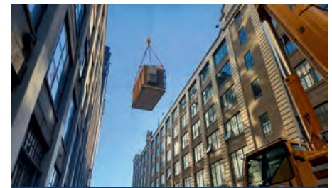
Roof Mounted Enclosures