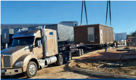
Data Center Power