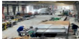
CASTING / FABRICATION