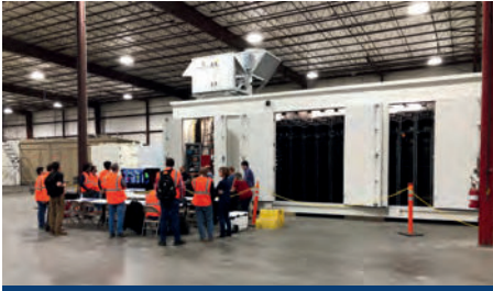
Battery Energy Storage